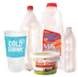
Plastic Bottles, Cups & Containers