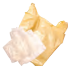
Plastic Bags & Film